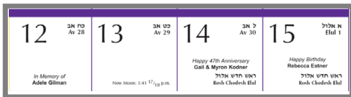
Sample calendar dates space

Please include this form with your check.